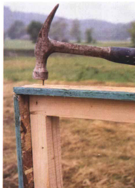
Simple wooden form creates a stronger cap. The author nails a frame of 2x lumber together for the basic form. Strips of OSB nailed to the sides give the form a depth of 1 in.