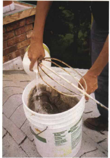
Acrylic additive makes a superior mortar. To increase the strength and the flexibility of the mortar, the author likes to add an acrylic resin fortifier to the mortar mixture.